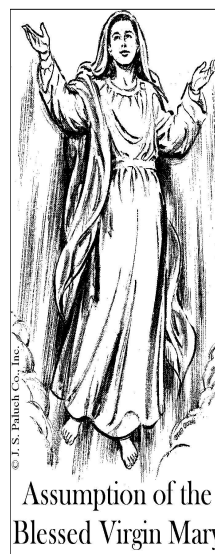
Assumption of the Blessed Virgin Mary